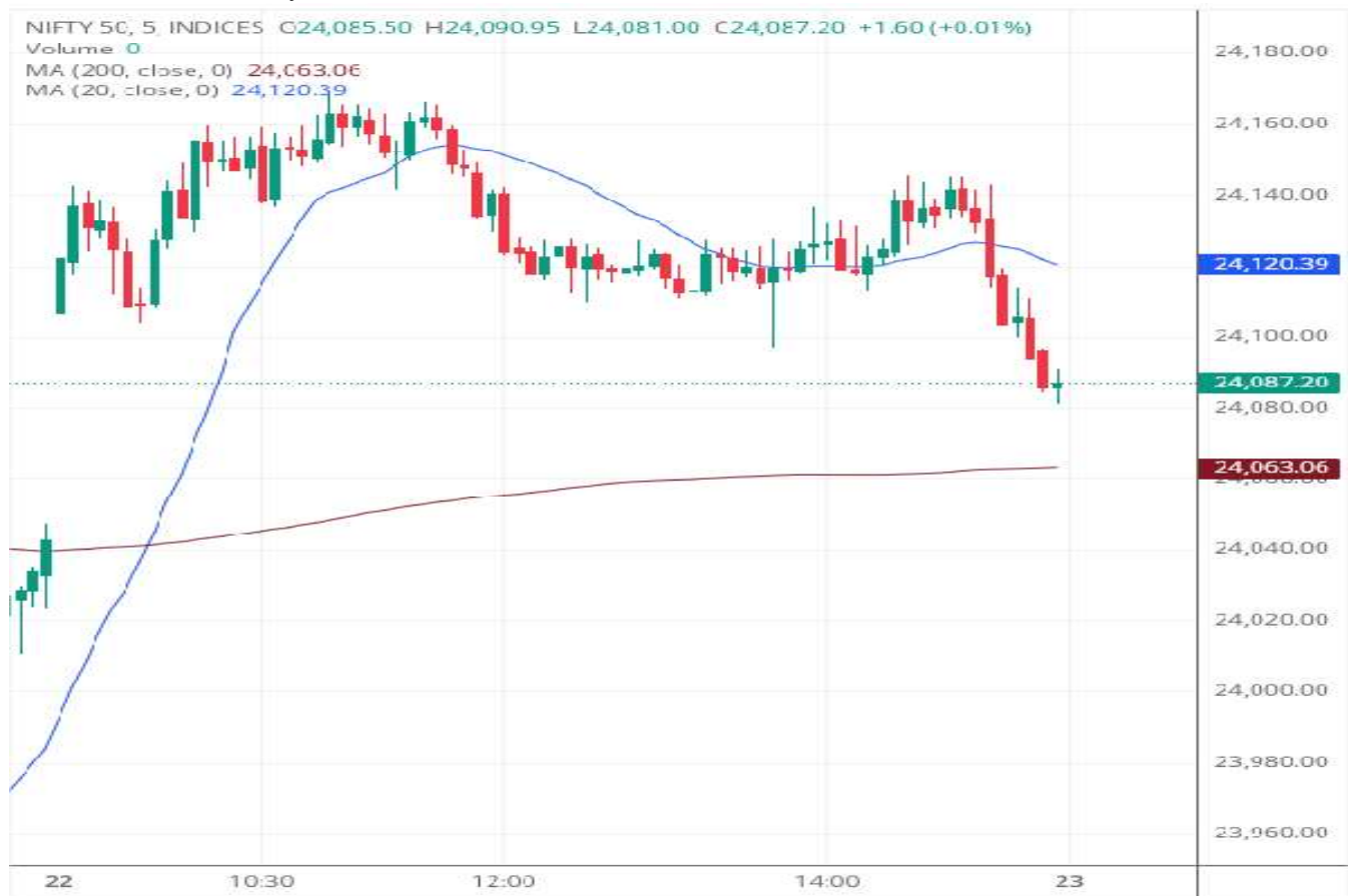
Nifty50 Technical Chart View

Disclaimer: These are all imaginary lines, which possibly act as support or resistance in the chart. The Weightage & Points could be roughly around this much.