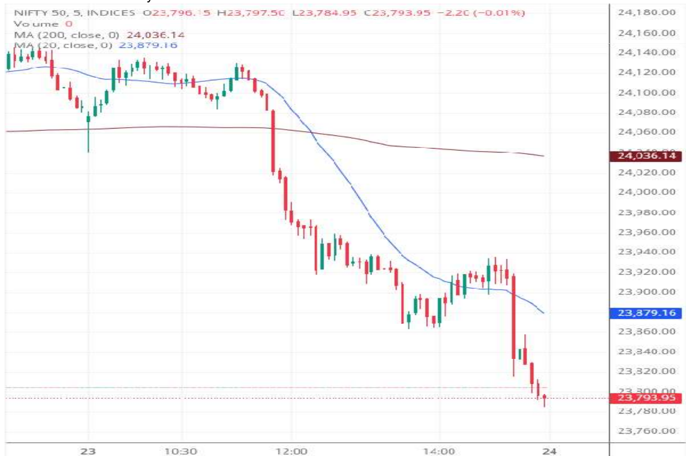
Nifty50 Technical Chart View

Disclaimer: These are all imaginary lines, which possibly act as support or resistance in the chart. The Weightage & Points could be roughly around this much.