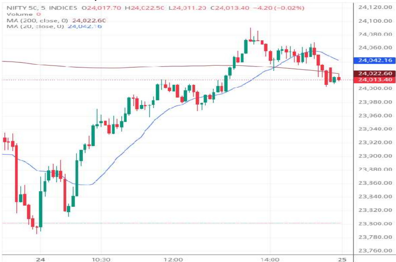
Nifty50 Technical Chart View

Disclaimer: These are all imaginary lines, which possibly act as support or resistance in the chart. The Weightage & Points could be roughly around this much.