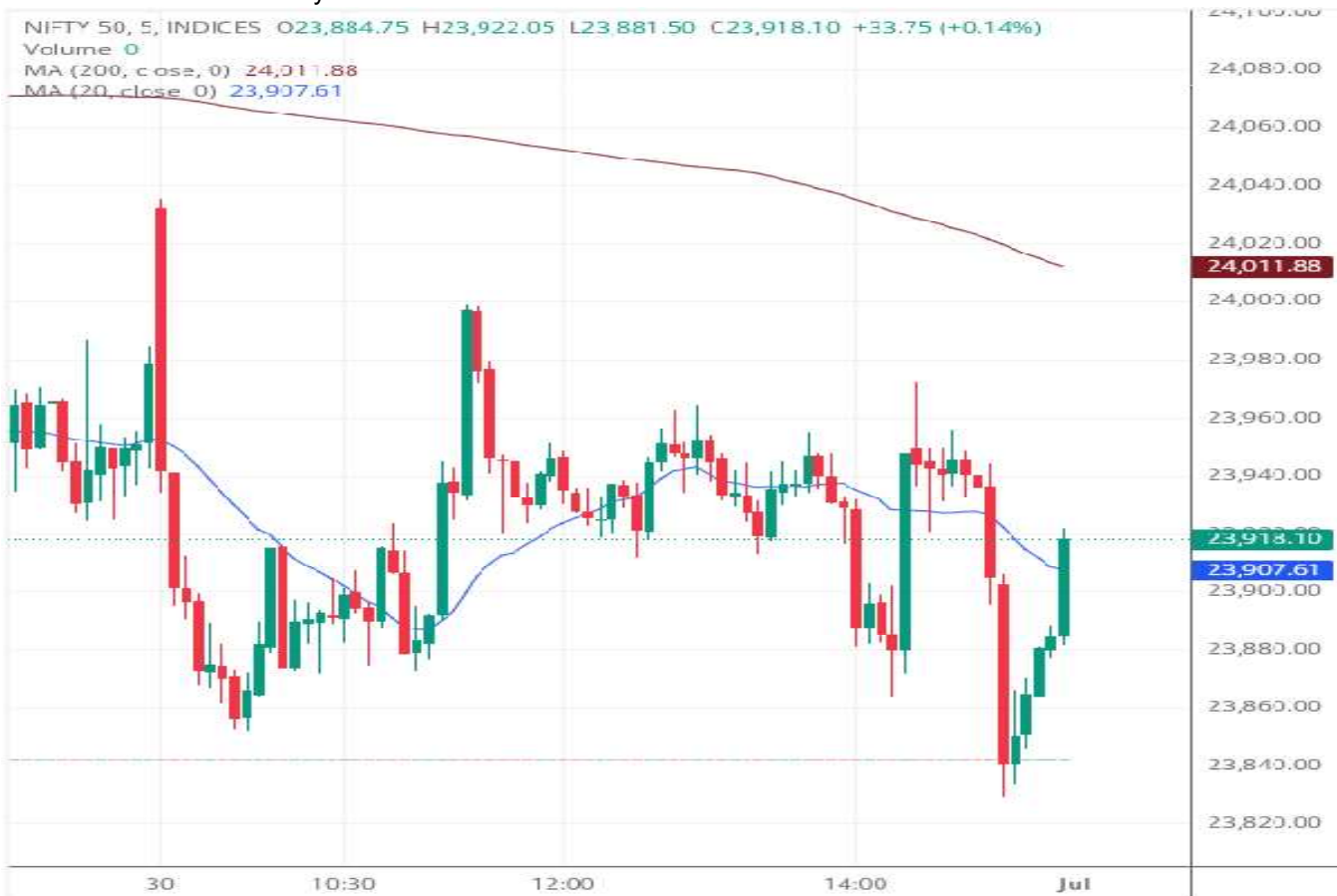
Nifty50 Technical Chart View

Disclaimer: These are all imaginary lines, which possibly act as support or resistance in the chart. The Weightage & Points could be roughly around this much.