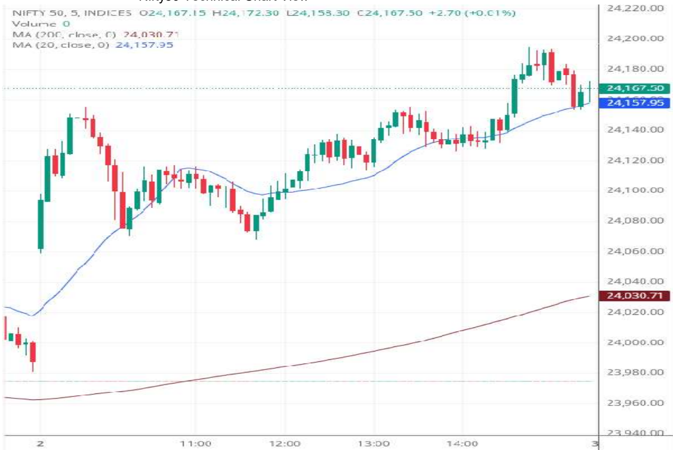
Nifty50 Technical Chart View

Disclaimer: These are all imaginary lines, which possibly act as support or resistance in the chart. The Weightage & Points could be roughly around this much.