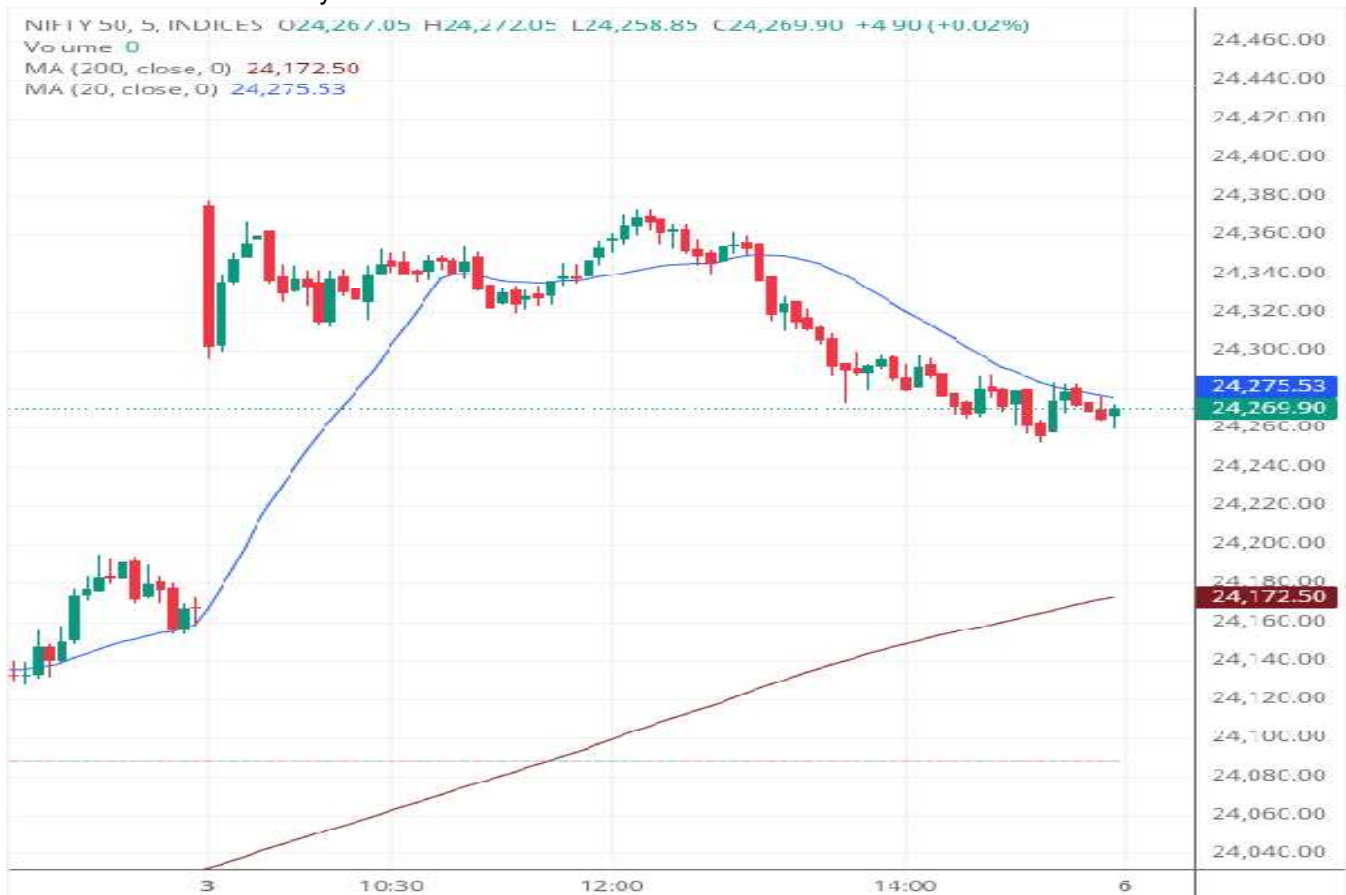
Nifty50 Technical Chart View

Disclaimer: These are all imaginary lines, which possibly act as support or resistance in the chart. The Weightage & Points could be roughly around this much.