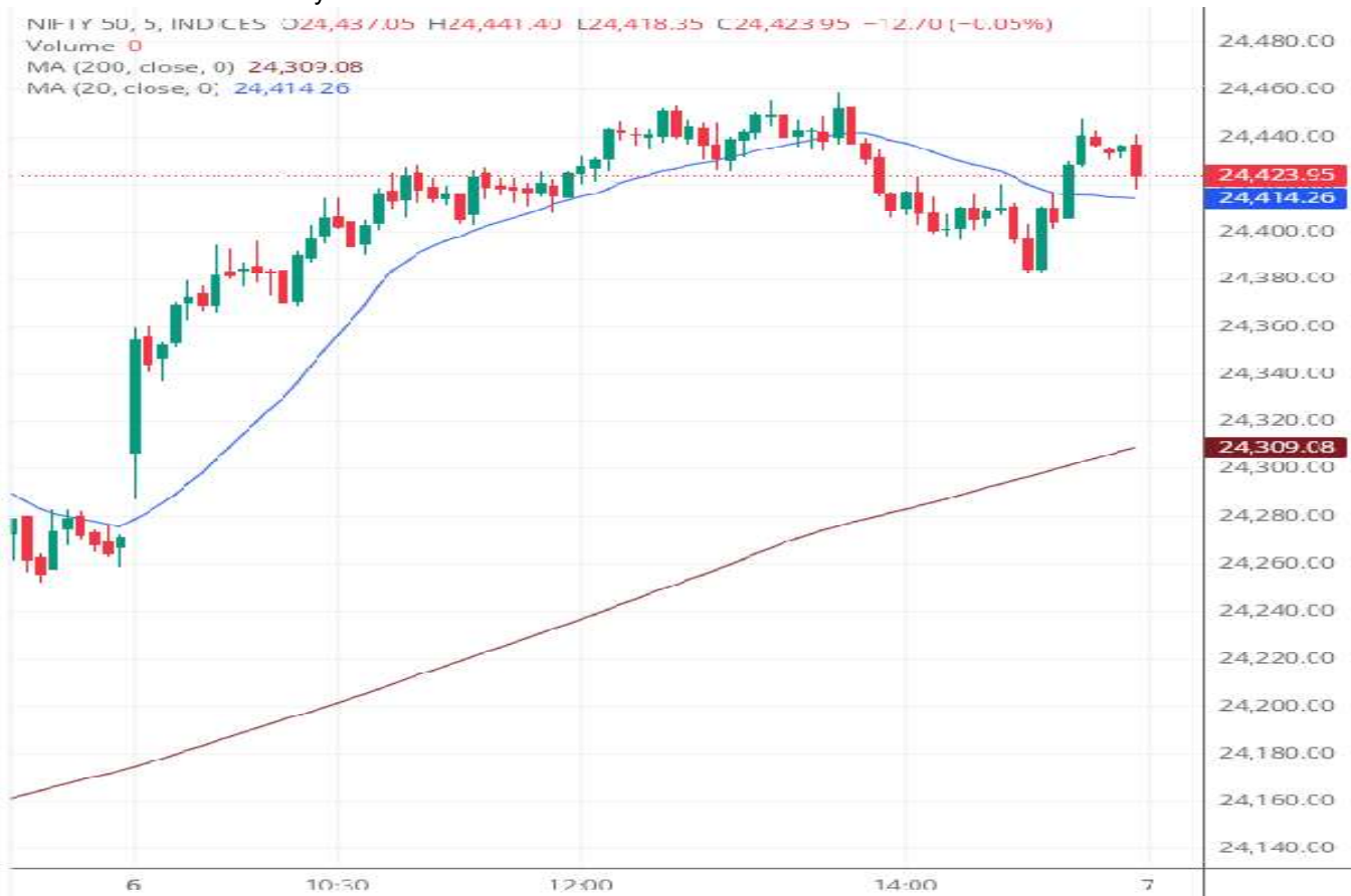
Nifty50 Technical Chart View

Disclaimer: These are all imaginary lines, which possibly act as support or resistance in the chart. The Weightage & Points could be roughly around this much.