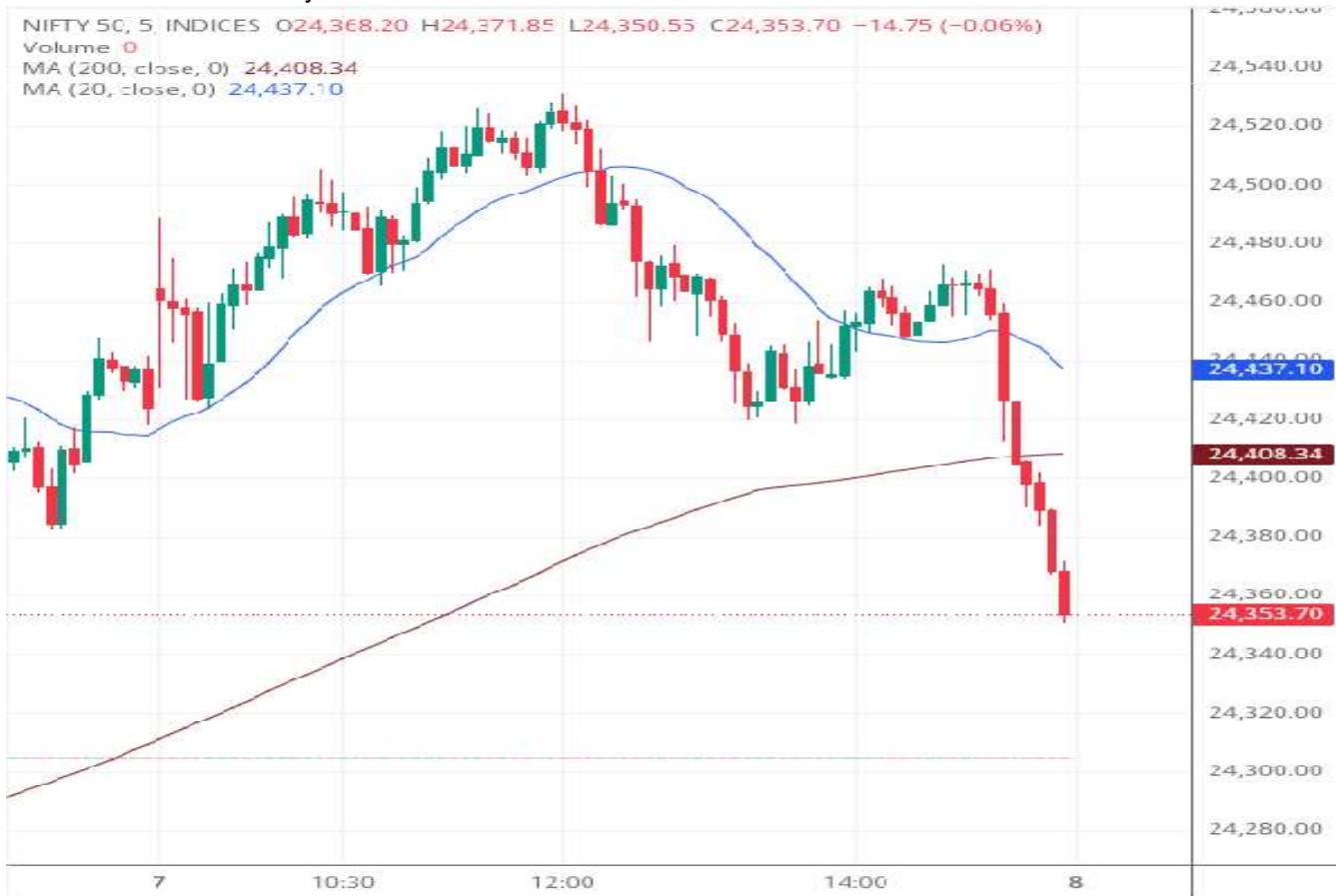
Nifty50 Technical Chart View

Disclaimer: These are all imaginary lines, which possibly act as support or resistance in the chart. The Weightage & Points could be roughly around this much.