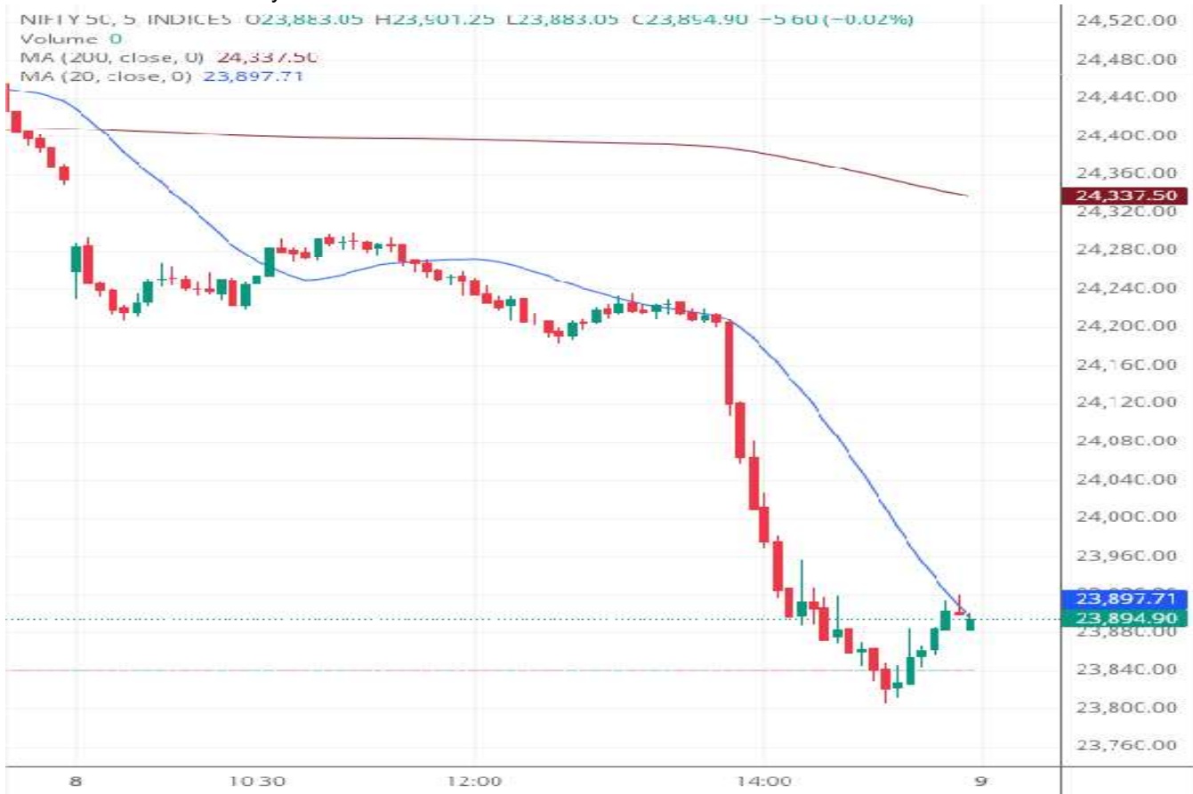
Nifty50 Technical Chart View

Disclaimer: These are all imaginary lines, which possibly act as support or resistance in the chart. The Weightage & Points could be roughly around this much.