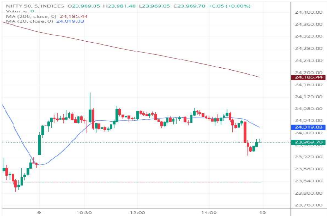
Nifty50 Technical Chart View

Disclaimer: These are all imaginary lines, which possibly act as support or resistance in the chart. The Weightage & Points could be roughly around this much.